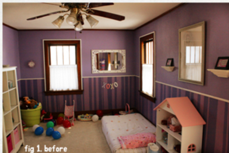
fig 1. before