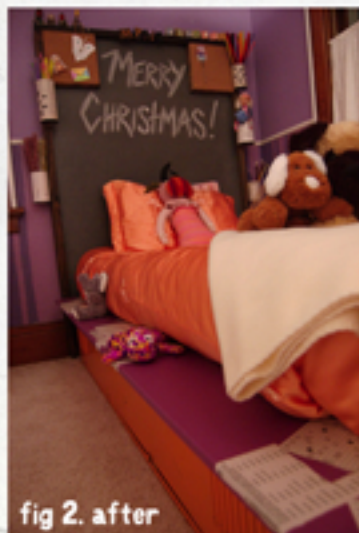
fig 2. after